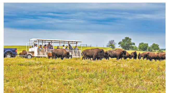
Take a tram tour to get up close and personal with the wildlife.

Events such as the Mountain Man Rendezvous and Christmas on the Prairie offer visitors the opportunity to experience what life was like for the people that lived in the area in the 1800s. The Mountain Man Rendezvous in October