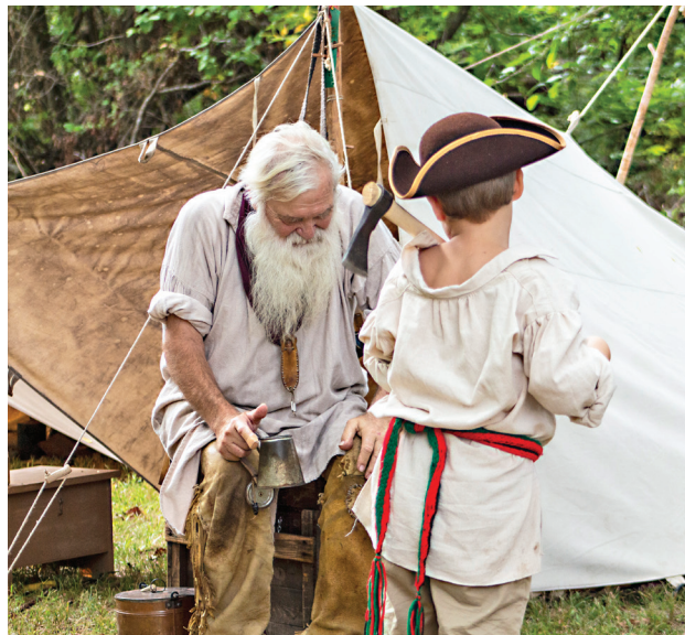
Visit during the Mountain Man Rendezvous to learn all about life on the prairie.

Maxwell Wildlife Refuge maintains a herd of roughly 200 bison. They are from the original herd that was bought in 1951 from