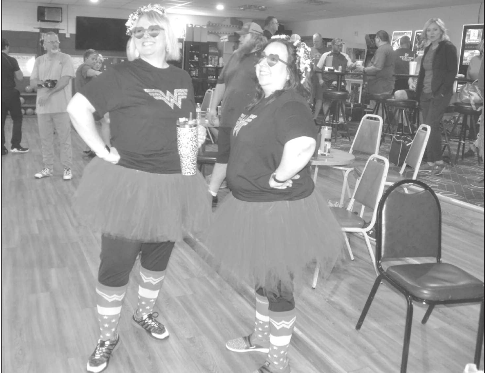
in the Community for Classrooms' bowling tournament on Saturday, April 12, at