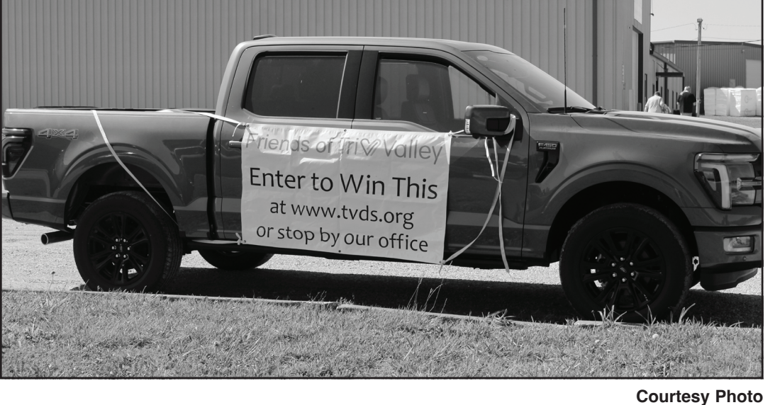
This 2025 Ford F150 Platinum is this year's prize for the 25th annual Friends of Tri-Valley Drawing.