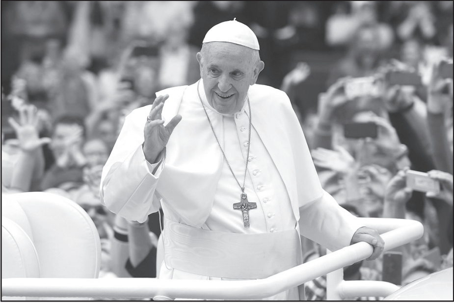
Pope Francis waves to the waiting crowds on College Green, as he travels in the Popemobile during his visit to Ireland. The head of the Catholic Church, who led 1.4 billion Catholics worldwide since 2013, died on Monday at the age of 88, the Vatican announced. The Argentinian-born pontiff was the first from Latin America.

exposition to the faithful. Francis asked not to be exposed. The Novendials begin: nine days of mourning during which masses are celebrated in suffrage for the deceased Pope. The funeral takes place in St. Peter’s Square, presided over by the Dean of the College of Cardinals; cardinals, bishops, heads of state and representatives of other religions participate. The Pope has asked to be buried in the Basilica of S. Maria Maggiore. The cardinal electors prepare for the Conclave; then the cardinals under the age of 80 retire to the Sistine Chapel, which is sealed to ensure the secrecy of the vote. They cannot have contact with the outside world. The voting follows a precise ritual. The Cardinals write the name of their candidate on a ballot, fold it and place it in a chalice. The ballots are then scrutinized and the results announced. If no one obtains the required majority (two-thirds of the votes), the ballots are burned, producing black smoke that signals to the world that the election has not yet taken place. When the new Pope is elected, the ballots are burned with dry straw, producing white smoke. After the election, the Cardinal Protodeacon announces to the world from the loggia of St. Peter’s the famous phrase “Habemus Papam”, followed by the name of the new Pontiff. The new Pope appears from the loggia and imparts the “Urbi et Orbi” blessing.