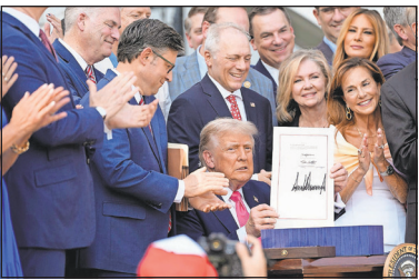
President Donald Trump holds up the “big, beautiful bill” that was signed into law as during a Fourth of July military family picnic on the South Lawn of the White House on July 4 in Washington, D.C.

WASHINGTON — President Donald Trump signed into law Friday evening his massive spending cut and tax break package to fulfill his domestic policy agenda on immigration and defense and overhaul American energy production. The “big, beautiful bill,” which Trump signed on Republicans’ self-imposed Fourth of July deadline, will make permanent the 2017 tax cuts from his first term and provide billions to carry out his plans of mass deportations, an immigration crackdown and increased defense spending. The nonpartisan Congressional Budget Office estimates that the bill could add $3.4 trillion to deficits over the next 10 years, according to its most recent analysis. “America is winning, winning, winning like never before,” said Trump, speaking to military families at a Fourth of July picnic on the White House lawn prior to the bill signing. Military aircraft