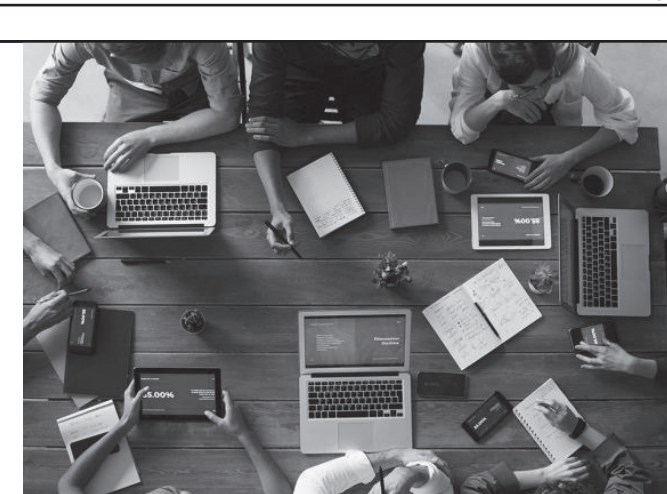
You're invited to a