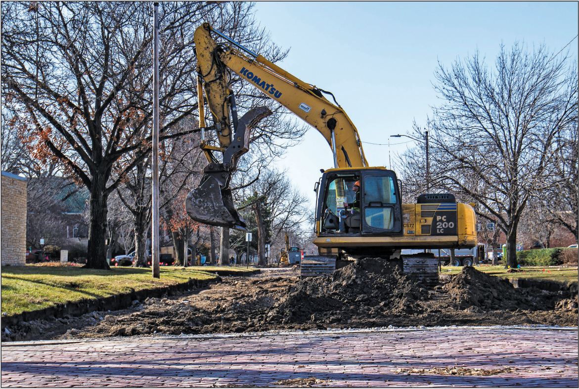
A worker for Bayer Construction Company operates an excavator on South Juliette Avenue in Manhattan, Friday, March 7, 2025. Bayer Construction started a $1.2 million pavement rehabilitation project Feb. 24, removing existing pavement on Juliette between Poyntz Avenue and Pierre Street, and replacing with brick surface. The project also includes storm drainage, sidewalks and sideroad tie-in improvements. A first phase, scheduled to last into May, impacts Juliette and the alley midway between Houston and Pierre streets.