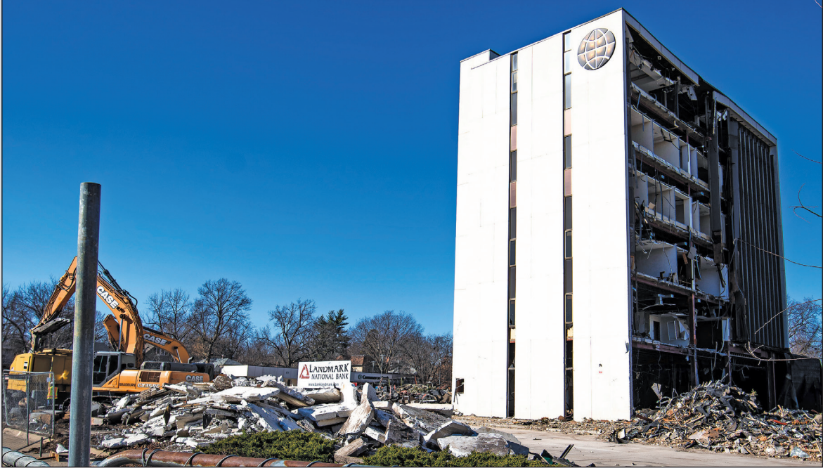
Demolition of Commerce Bank on Poyntz Avenue in downtown Manhattan continues Tuesday, March 11, 2025. It is being razed with a new residential and retail space to take its place.