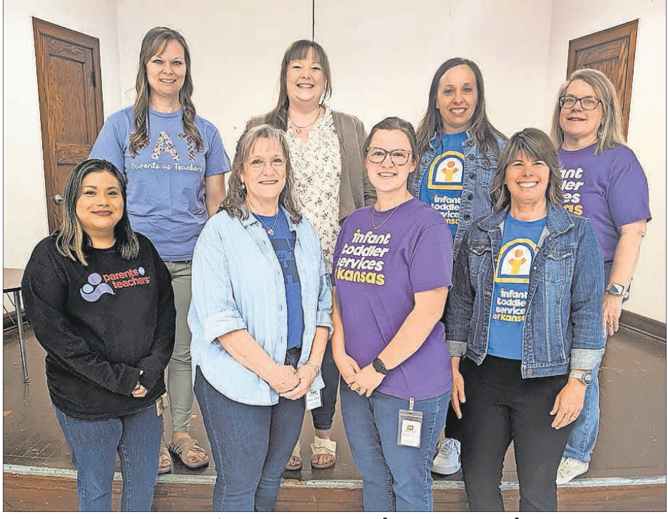
Harvey County PAT and Infant/Toddler teams.

WHEREAS, home visiting can include a variety of different programs and models, including early childhood home visiting programs and parenting education programs;