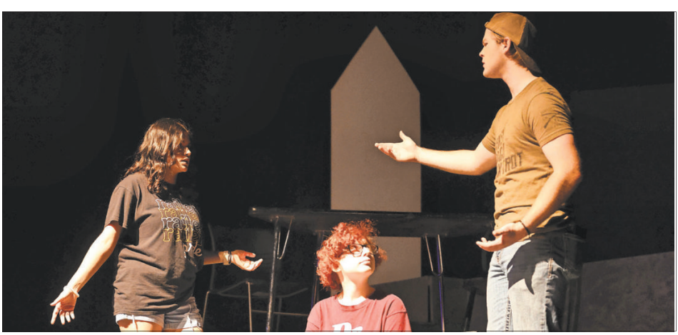
Newton High School Drama II wrote and produced a show called "Map of the Teenage Brain," a series of dramatic scenes centered on raising awareness around mental health—particularly through the eyes of teenagers.

Admission was by donation, with proceeds benefiting mental health pro-