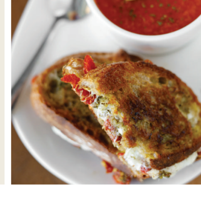
Savor the Sunday specials! Open 10 AM ťo 2 PM

3001 Ivy Drive, North Newton | 316-836-4850