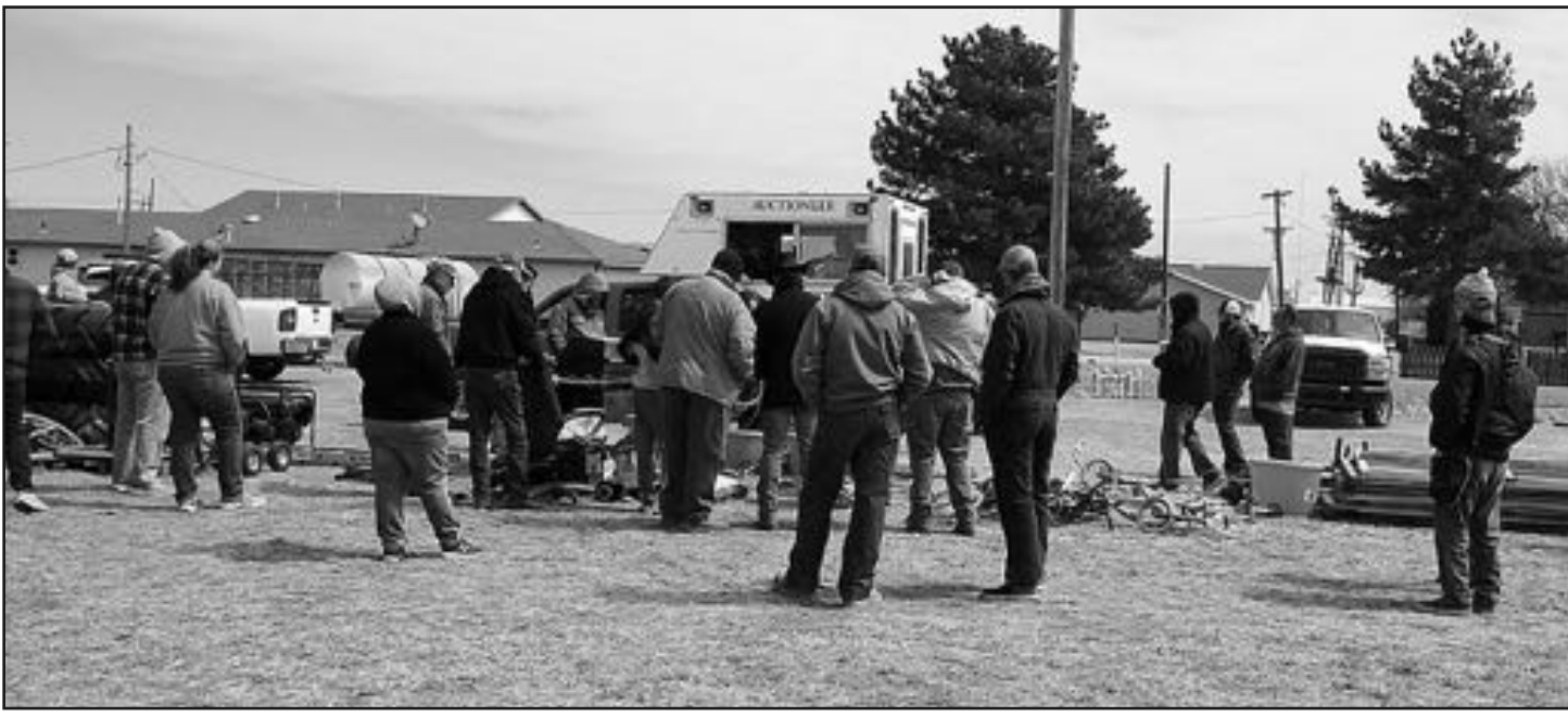
The sixty-first annual Kiwanis Auction has lots of goodies for the buyers to browse Friday and Saturday at the fairgrounds. Sellers and buyers are already looking forward to next year.