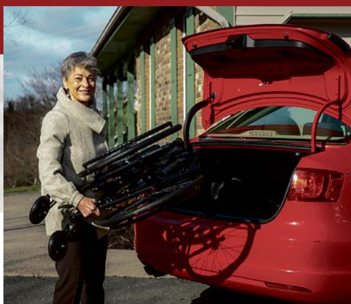
Easy to Transport and Store

It's so light weight that it's no problem to lift in and out of the back of my car. It's also easy to set up and collapse down. It is very compact and the wheels come off for compact packing alongside luggage or groceries etc. My Mom finds it very comfortable to ride in as well and enjoys the look. We both love it.